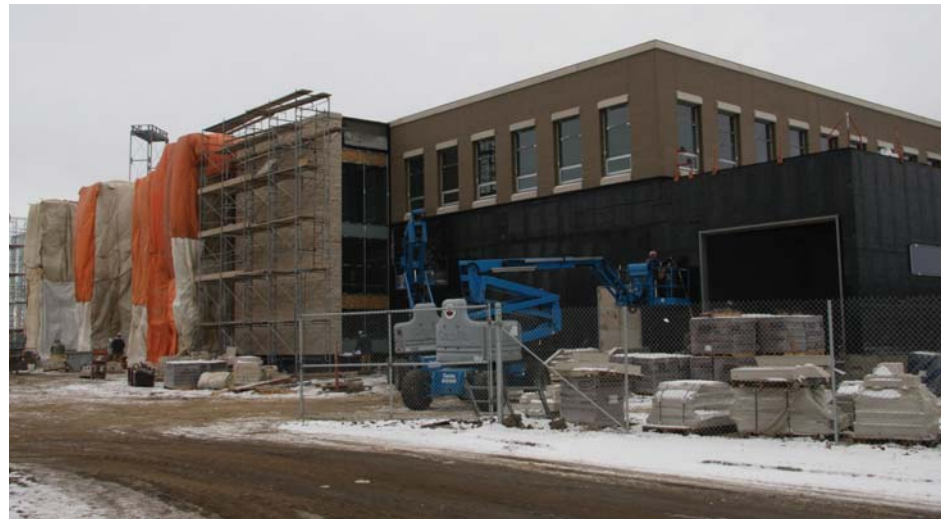
The new Strathcona County Library, under construction as part of the Community Centre in Centre in the Park.

Hand-in-hand with increased space will be a bigger collection, newer and revitalized—with more books, DVDs, CDs, kits, and magazines for all age groups.