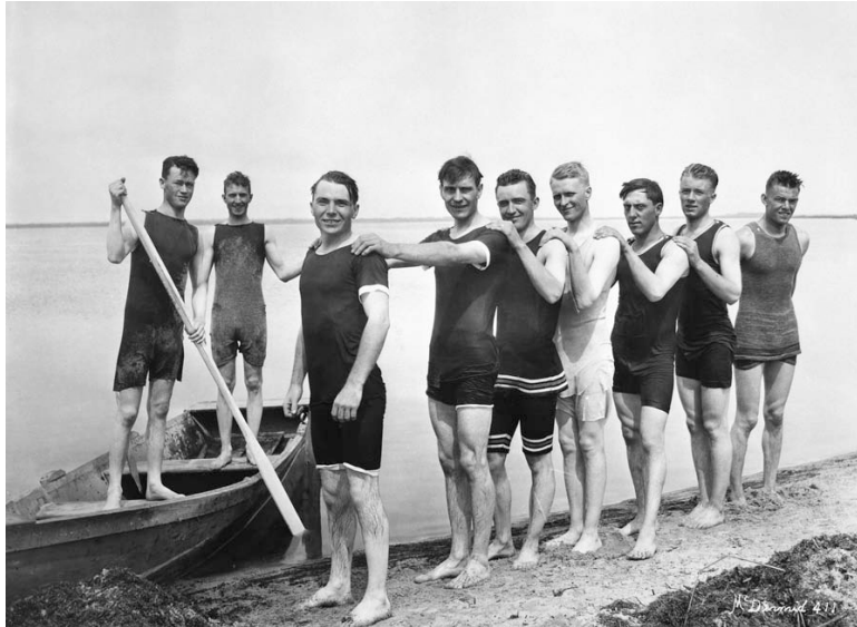
Swimmers at Cooking Lake, 1912

Heritage conservation has many potential cultural, social, economic and environmental benefits. Conserving heritage allows a community to retain and convey a sense of its history, and provides aesthetic enrichment as well as educational opportunities. Heritage resources help us understand where we have come from so that we can appreciate the continuity in our built environment from past to present to future. Historic buildings and landscapes become landmarks and touchstones for the community, and the retention of historic elements serves to moderate the impact of rapid change, currently so evident in Strathcona County.