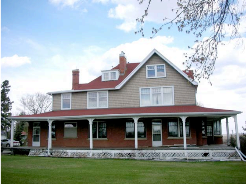
Bremner House, 1902 [above] and Smeltzer House, 1920 [below].