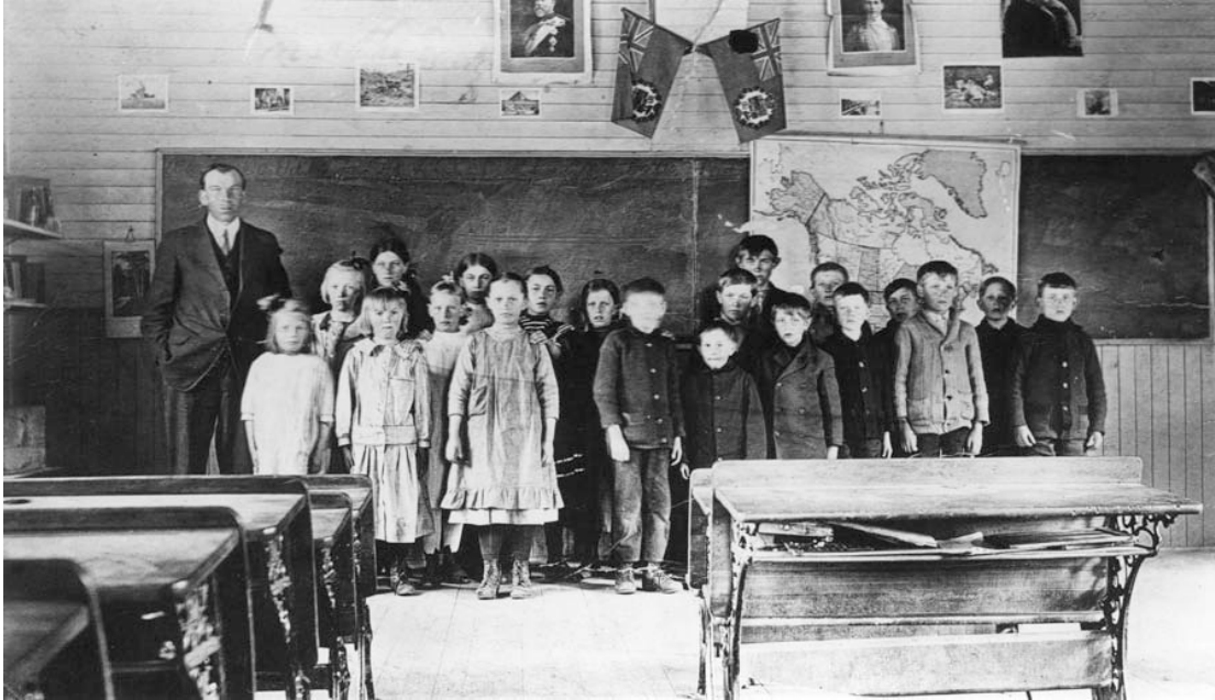
Teacher and children at School

In 2003, the United Nations Economic, Scientific and Cultural Organization (UNESCO) Convention for the Safeguarding of Intangible Cultural Heritage introduced a widely accepted definition of “intangible cultural heritage”, or ICH. As used by UNESCO, ICH is a term for living social and cultural practices including language, arts, traditional knowledge and skills and rituals involving nature and spirituality. It also refers to related tools and artifacts that a community or group recognizes as inherited from its past and as important to its current identity.