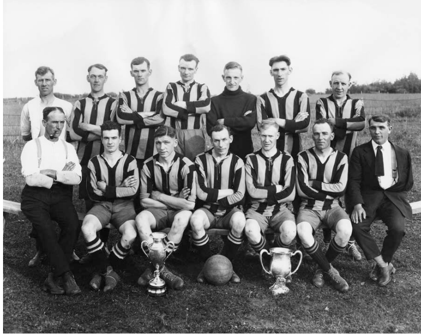
Clover Bar football team, 1925

Strathcona County is the fourth largest municipality in Alberta. Its current day boundaries comprise the urban centre of Sherwood Park and eight small hamlets amidst a vast rural area made up of farms and country residential subdivisions – all encompassing 488 square miles. The historical development of Strathcona County has resulted in a unique legacy of historic buildings, archaeological sites, cultural landscapes and other resources.