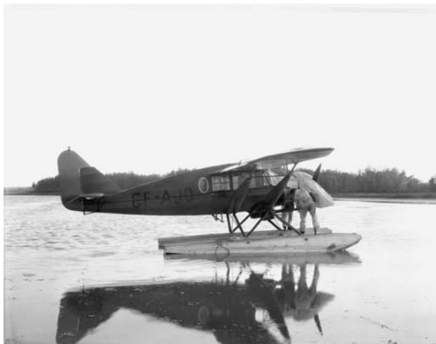
Cooking Lake Seaplane Base Donald Luxton & Associates Inc. Dec. 2008

Throughout the County, there is evidence of many early trails and roads that connected the far-flung small settlements to each other and to larger centres. Later railroad rights-of-way are still in active use, but no early train stations have survived. Neither are there any remaining grain elevators in Strathcona County. South Cooking Lake was once the site of a seaplane base.