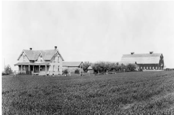
Farm,1924

An initial inventory of historic sites and resources in Strathcona County was conducted by the province in 1974-75, and was mapped onto an Historic Resources Map in 1992. There were also several other surveys conducted by the province, and the site forms have been deposited as part of the Provincial Heritage Inventory. Since 1974, the province has collected information on approximately 450 historic sites in the County, though we know there are numerous duplications in this list and many of these sites no longer exist. These previously-identified sites have not yet been mapped on the County's POSSE system (municipal database) and their current condition is not known at present. The actual number of sites that still survive, and have sufficient significance and integrity to be managed as part of a heritage management program, will be much lower than this. It is anticipated that the realistic number of sites that should currently be identified as the basis of a Heritage Register would be in the range approximately 75 sites.