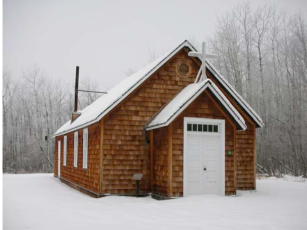
St. Margaret's Roman Catholic Church, 1912