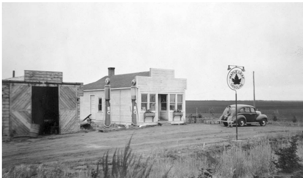
Maple Leaf Petroleum service station, 1939

One goal of the River Valley Alliance is to capture and convey the history of the North Saskatchewan River within Alberta's Capital Region. The initial concept of creating an integrated park along the river valley goes back nearly 20 years. The RVA came into existence in 1996 as a group of volunteers representing five Capital Region municipalities. They shared a vision of transforming an 88 km stretch of river valley into a world-class metropolitan river front integrated park. Other municipalities joined and the RVA was formally incorporated in 2003. Its founding shareholders include the seven municipalities holding lands in the Capital Region North Saskatchewan River Valley - the Town of Devon, Parkland County, Leduc County, City of Edmonton, Strathcona County, Sturgeon County and City of Fort Saskatchewan. The RVA partners share a common goal - to protect, preserve and enhance the Capital Region's river valley park system for year-round accessibility, and enjoyment of its citizens and visitors. Each of the seven municipal shareholders appoints councillors and private individuals to serve on The RVA Board of Directors.